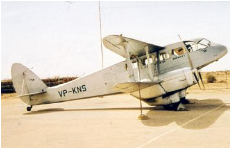
In the beginning, a De Havilland Dragon Rapide