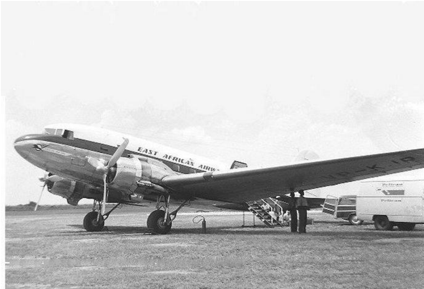
An East African Airways DC-3 VP-KJR at Kasese, Uganda by Bret Langevad