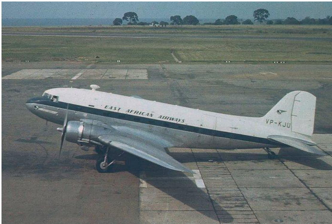
DC-3 VP-KJU at Entebbe, with Lake Victoria in the background