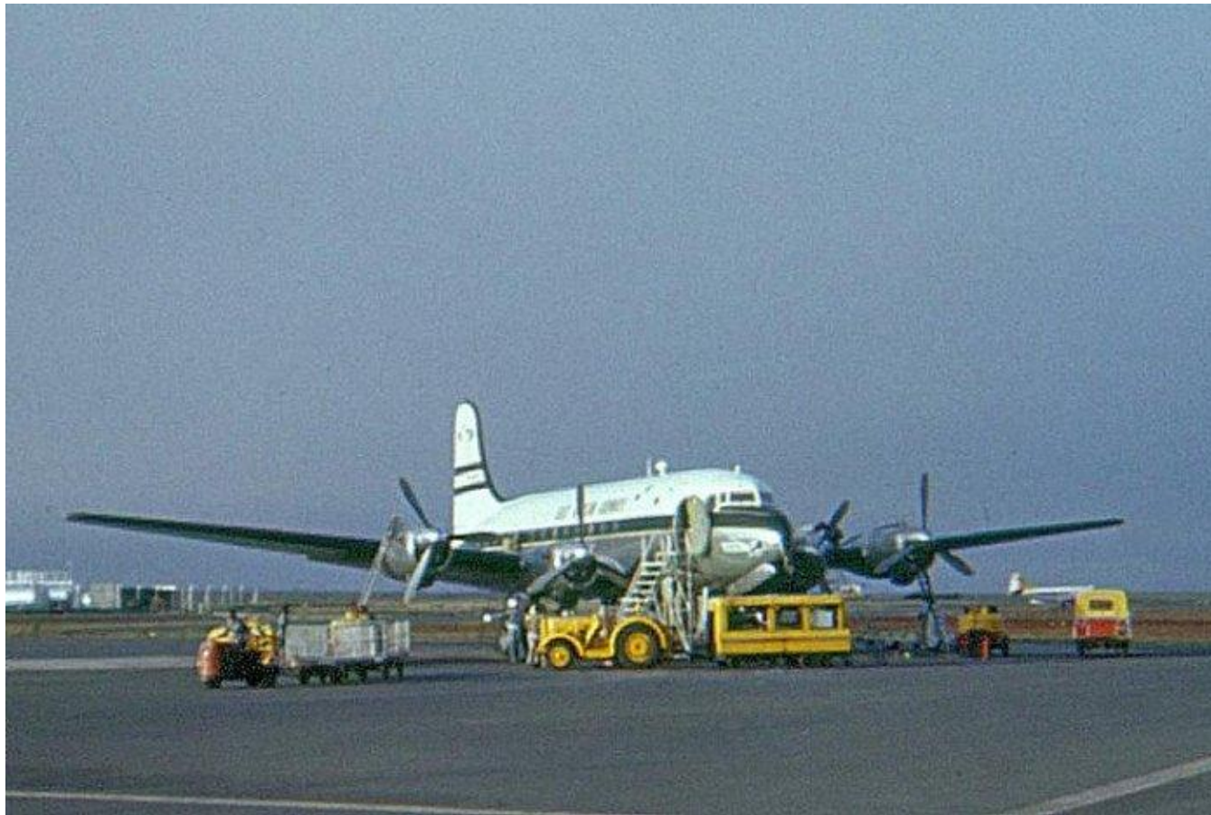
An East African Airways DC4m Argonaut at Nairobi