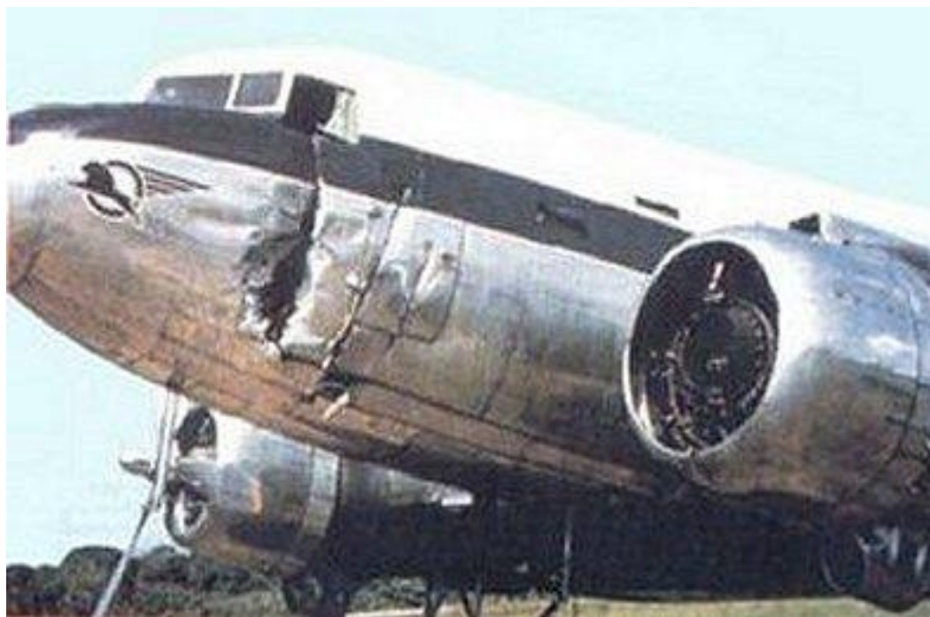
A picture of the East African airways DC-3 referred to above following the landing accident where the propeller dug into the soft ground alongside the runway at Kilwa – the strikes of the propeller against the fuselage can clearly be seen – twice against the crew door and finally into the flight deck itself.