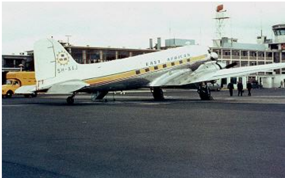
An East African Airways DC-3 in a later livery

Note Not all of the airfields served by East African Airways in 1957 can be found today either in Microsoft Flight Simulator 2004, Google Earth or other sources! On occasions a guess has been made at the name of the current airfield. Where this is the case this is noted in the attached schedules.