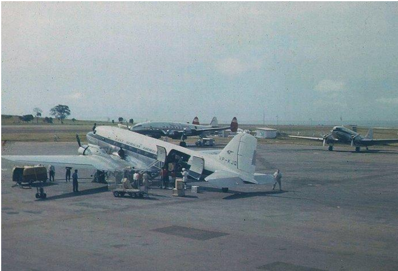
East African Airways DC-3 VP-KJQ at Entebbe with a Trek Airways Constellation as background by Malcolm Crow