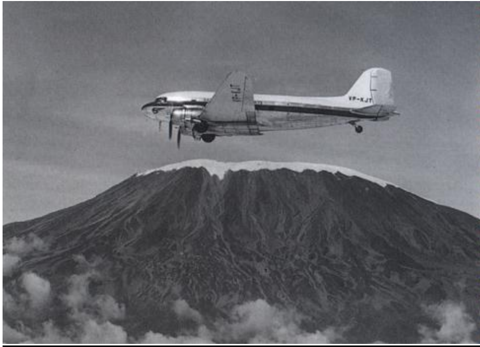
A classic picture of an East African Airways DC-3 passing Mount Kilimanjaro in East Africa

East African Airways was formed on the 1 st January 1946 to serve the four territories of the East African Community of the then Tanganika (now Tanzania), Kenya, Uganda and the Protectorate of Zanzibar and Pemba. The latter are two small islands in the Indian Ocean off the then Tanganika, now Tanzania.